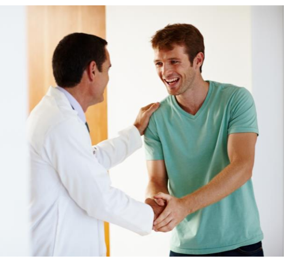
Figure 3: iStock.com/GlobalStock

Levels of function and satisfaction will vary between patients, and you should be aware that the hip resurfacing device may not restore function to the level expected with a normal, healthy joint for some people.