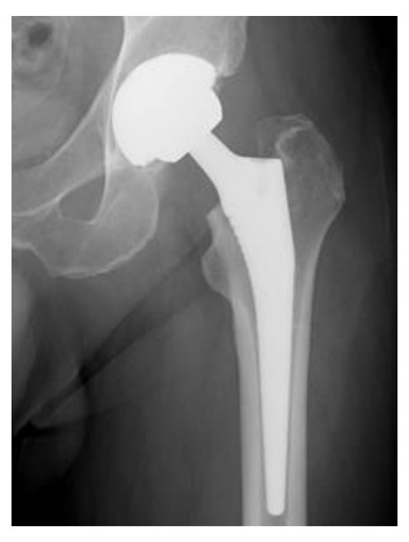
A traditional total hip replacement that removes the top section of the femur to insert a stem.